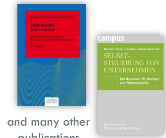
and many other publications

Born 1947 in Vienna, married, 1 daughter